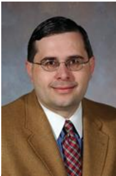
J. Wesley Null

community in England, numbering 35,000, to escape the hardships imposed on Eastern European Jewish communities (pp. 25-43). In response to the pervasive “Jewish Question,” Kandel would mediate between the British and Jewish cultures to learn that “assimilation was protection against discrimination” (p. 38). Kandel’s educational experience is very important to understand as well. Kandel attended a British public elementary school during the era that witnessed the proliferation of universal education and consequently internalized the British education ideals of citizenship and non-sectarian Christian morality (p. 42). Kandel later attended the prestigious Manchester Grammar School, which was rooted in Christianity and classical scholarship (p. 46). Despite excelling in a curriculum grounded in the classics, humanities and religion, Kandel was not awarded a scholarship to Oxford or Cambridge and instead attended the University of Manchester in 1899, an institution that oriented itself toward educating males for public service using a non-sectarian curriculum and civic purpose. Kandel received his bachelor’s degree in classics and later received his masters in education at the University of Manchester, at which point he sought to “perpetuate the ancient traditions that he had been studying for fifteen years” (p. 61).