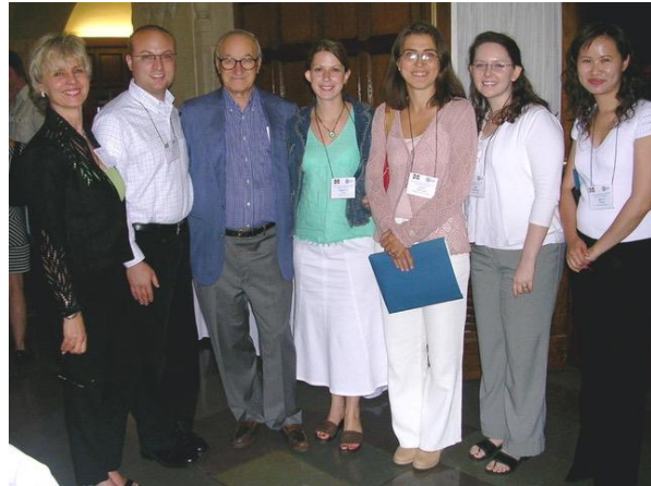
Figure 5. Group picture at the 2006 Global SELF Conference (with Ohio State students with psychologist Albert Bandura)

Don’t be afraid to trail your spouse but know when to leave. As I wrote the first section of this essay, I realized how often I made a major career move as a “trailing spouse.” The move to the University of Texas, to Rutgers University, and to The Ohio State University all were predicated on staying in a relationship. At