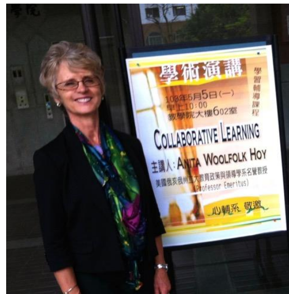
Figure 6. At conference in Taiwan.

Collaboration can make projects better, and certainly makes them more fun. Collaboration is not always easy. Who should do what? Who is first author? But making commitments to others to complete your share of work is a great antidote to procrastination and ideas developed together can be more creative. Setbacks are easier to take as well when the misery is shared. I believe the Teachers' Sense of Efficacy Scale we developed at Ohio State continues to be a valuable instrument in part