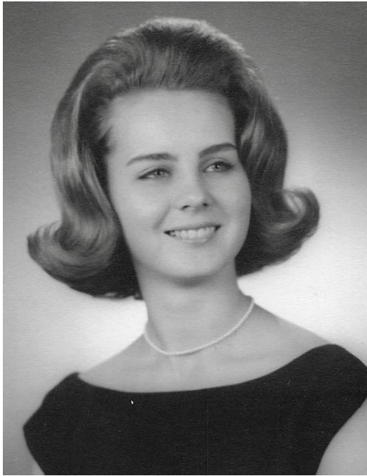
Figure 1. High school senior picture.

professor had been wrong, and I probably was not going to go from an A student in high school to a C student in college. Lubbock also brought sand storms and tornados hovering over the football stadium during a game and several other experiences, including a brief stint in a very traditional sorority, that helped me figure out who I was not .