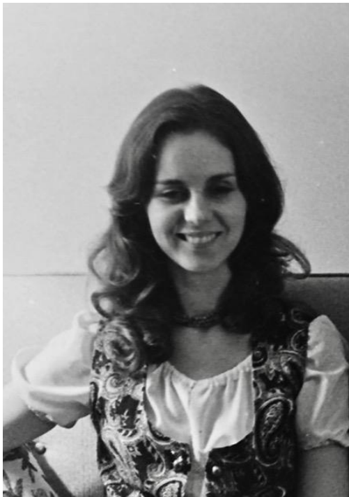
Figure 4. From the University of Texas days.